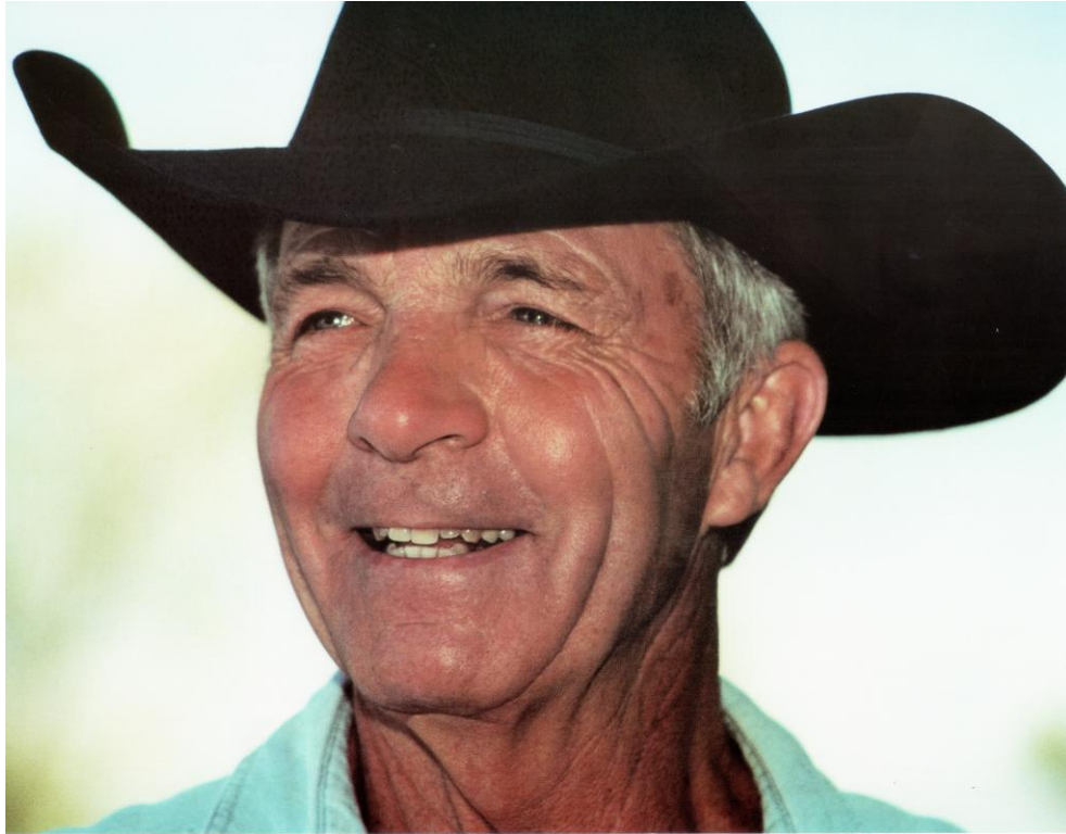
Loren Janes publicity photo.