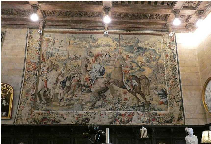
Figure 3. “Battle on Plateau, a tapestry of one of Scipio Africanus’s battles, Assembly Room, Hearst Castle.”

In the main house, a French Renaissance fireplace dominates the Assembly Room and medieval choir stalls can be found in both the Assembly Room and Refectory. Magnificent tapestries hang on many of the walls, covering and decorating the walls much as they did the cold stone ones of castles and homes in olden times. A set of four 16th-century tapestries depicting deeds of Scipio Africanus, the Roman general who defeated Hannibal, hang in the Assembly Room.