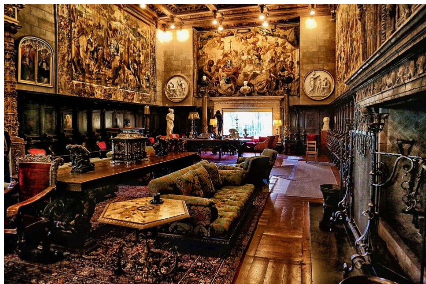
Figure 2. "Assembly room, Hearst Castle, California."

But there is much, much more to Hearst Castle. William Hearst was an avid art collector and filled his hilltop retreat with art treasures from around the world. As a result, the Castle offers an eclectic blend of old and new that is sure to fascinate the art enthusiast. The architecture of the Casa Grande combines elements of Spanish and Moorish artistic styles. The guest houses remind us of Mediterranean villas. Coffered ceilings, a favorite in many of the rooms, range from 17th and 18th-century originals (many from Spain and Italy) to copies made by artisans employed by Hearst in the 1920s and 30s. Original Egyptian, Roman, and Greek statues and other artifacts share space with later copies. Authentic Greek vases lend an atmosphere of elegance to Hearst's Library.