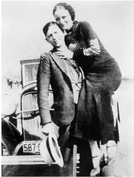
Figure 1. "Portrait of Bonnie Parker and Clyde Barrow, c. 1933."

What made their story so romantic? Was it their youth and the love they shared? Or the dangerous life they lived? Or that they robbed wealthy banks when so many were so poor? Perhaps all of the above.